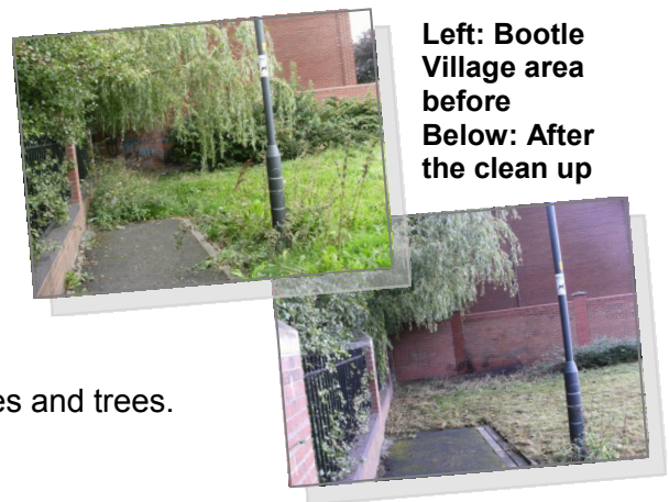
Left: Bootle Village area before Below: After the clean up

Saturday Skips were placed in five key locations in South Sefton throughout October for people to get rid of rubbish which could have become Bonfire material.